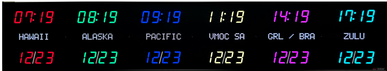
Model 6613P - 2.5" bar segment time & date, 1.2" zone labels, 6 zones